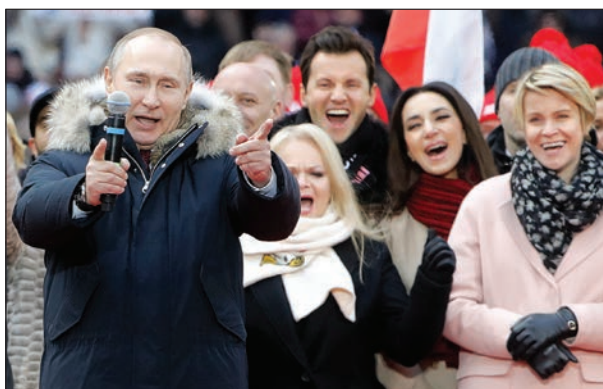
Which one will have the nerve to stop laughing first?

Yeltsin was saved in 1996, at the high cost of failing to build up the strong democratic institutions the country desperately needed. Four years later, a leader far more ruthless and anti-democratic came along, and Putin found it all too easy to bend and break these feeble institutions. It's still unfathomable that Russia went from joyously celebrating the end of totalitarianism to electing a KGB