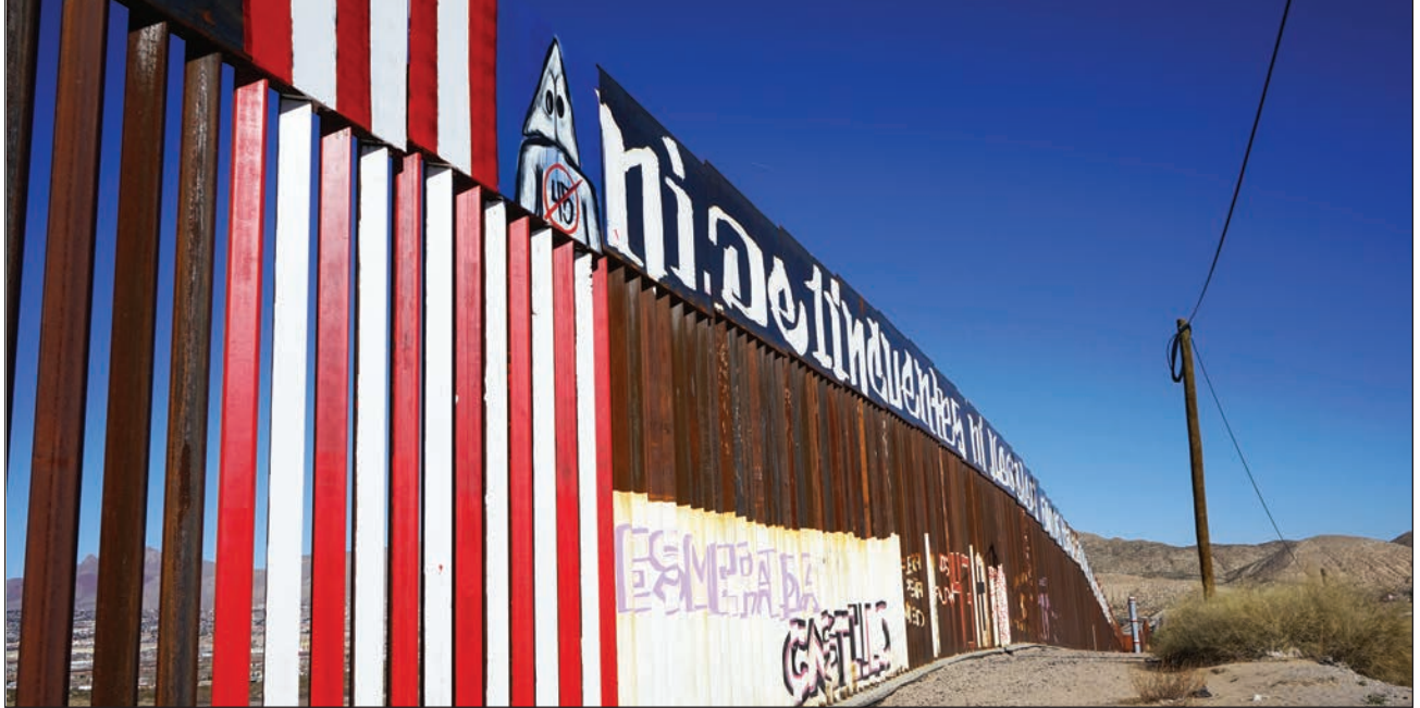
Fences help to define the U.S.-Mexico border in El Paso.