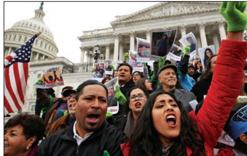
A pointless protest since the judiciary intervened

The dreamers are once again the victims of irreconcilable political demands. The administration is happy to sign a deal giving them a path to citizenship, but it also demands a reduction in immigration levels and the abolition of the Diversity Immigrant Visa Program (a lottery that awards green cards to up to 50,000 foreigners per year). Immigration restrictionists in the House GOP, meanwhile, demand a substantial increase to border security. None of