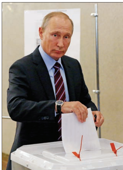
Vladimir Putin 'votes' in municipal 'elections,' September 10, 2017.

should be treasured. Yet the media of the free world persist in referring to "elections" in dictatorships like Putin's Russia because they have no vocabulary to call it anything else—a predicament undemocratic regimes exploit very well. Even calling Putin a "president" is at best inaccurate and abominable propaganda at worst. A president is "the elected head of a republican state" according to my dictionary, while Putin isn't elected and Russia isn't a republic. He may have been a president when he first came to power in 2000, that I will grant. But since 2012, when he returned to the presidency, unconstitutionally, after allowing Medvedev to warm the chair for four years while ceding none of his