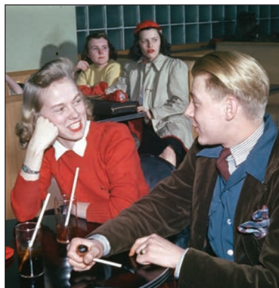
Just somewhere to hang out

After thousands of hours of observations and interviews, what these ethnographers found is that hanging out in bedrooms is more likely to lead to sex. Indeed, the researchers suggest creating 'alternative spaces whose availability might steer drunk kids away from ending up on a dorm bed.'