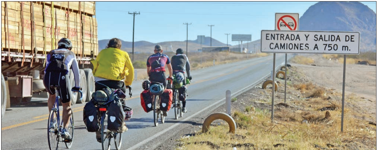
Your intrepid correspondent and friends leaving Agua Prieta on the road to Janos

for the sake of their engineering careers, and they are well compensated for the inconvenience of living in Mexicali by a Mexican firm making airplane turbines for the U.S. market. Both women are in their late 20s with no family obligations, and they will eventually move back south, to the Mexico that feels like home. Northern Mexico isn't really Mexico, they explained to me. The culture is diluted by the close proximity of the United States, which pulls everything toward itself.