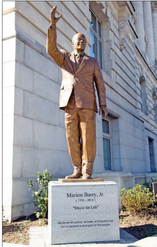
Mayor Barry in bronze

Which brings us full circle. In a city full of neoclassical monuments and equestrian generals, the Barry fig-