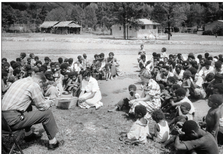
American missionaries holding a Sunday service in Papua New Guinea