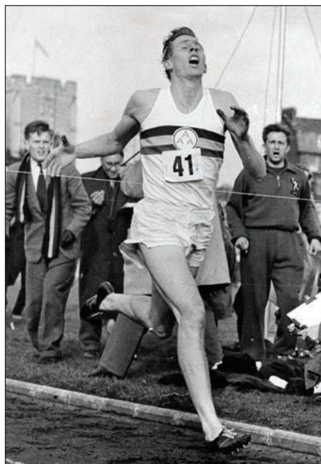
Bannister at the tape, May 6, 1954