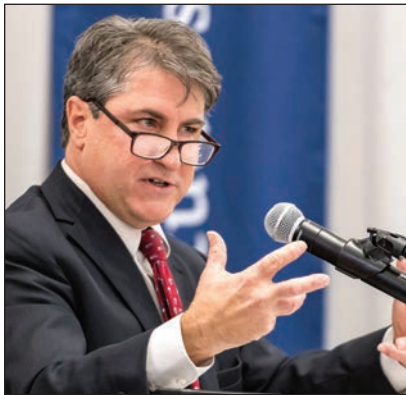
Patrick J. Deneen

According to Deneen, individualism and statism thus go hand in hand. Classical liberals may lament the rise of “big government” but they fail to recognize that big-government liberalism was the inevitable consequence of individualism’s triumph: Only the “welfare state” could provide the safety net that families and local charities once provided, and only the “therapeutic