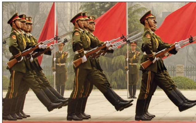
Hey, the new investors are here!

of this nation, we've ever faced a competitor and potential adversary of this scale, scope, and capacity. . . . They are carrying out a well-orchestrated, well-executed, very patient long-term strategy to replace the United States as the most powerful and influential nation on Earth."