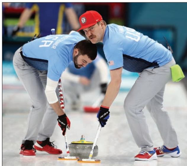
John Landsteiner, left, and Matt Hamilton of Team USA on their way to a gold medal in South Korea, February 24