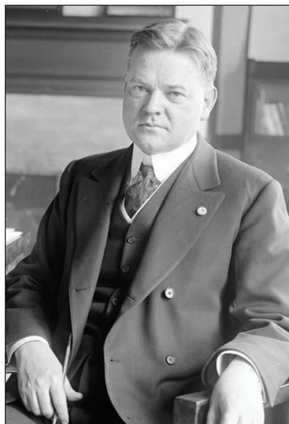
Head of the U.S. Food Administration, 1917