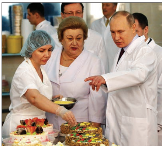
'The frosting is uneven on that one.'

Russia's election spectacle on March 18 isn't only a domestic distraction. It provides Putin's defenders in the free world with rhetorical ammunition, as do the approval polls and fake controversies over the fake opposition candidates. There is no form of democratic process or opposition in Putin's Russia. Pretending otherwise makes you complicit in his propaganda. Stop calling them elections. Stop calling Putin a president. Stop calling to congratulate him on his victories. Let us begin the fight against Putin's lies with the fundamental truth about what he really is. ♦