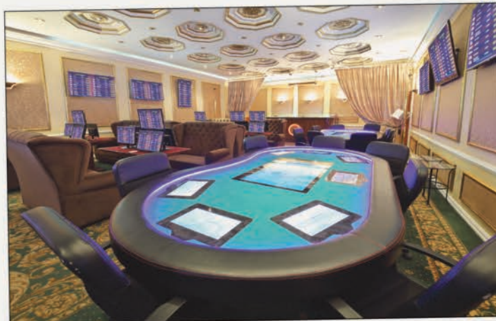
An architect’s rendering of the new embassy’s proposed ‘Peace Talks Table’ that also hosts video poker

“Our ambassador can host dignitaries at Emeril’s kosher steakhouse and take in our terrific new Baz Luhrmann show,