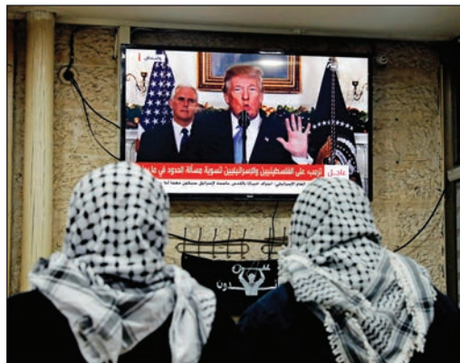
They’ll have to get used to it.

Why all the hyperbole? After all, it’s a simple fact that Jerusalem is the capital of Israel and has been ever since its War of Independence ended in 1949. When an American president or secretary of state goes to see the Israeli prime minister or speak to the Knesset, that’s where he or she goes. In 2016 Barack Obama went to the Mount Herzl cemetery in Jerusalem to deliver a eulogy for Shimon Peres. The White House released the transcript under the heading “Remarks by President Obama at Memorial Service for Former Israeli President Shimon Peres, Mount Herzl, Jerusalem, Israel.” Nine hours