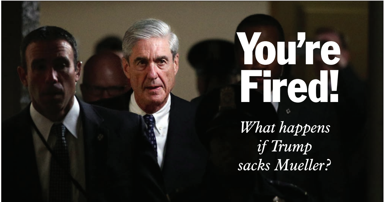
Robert Mueller after meeting with members of the Senate Judiciary Committee, June 21, 2017