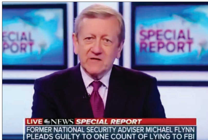
ABC's Brian Ross earns himself a four-week vacation.

On inauguration eve 1991, in Rhode Island, the departing governor, Edward DiPrete, had a morsel of news for the incoming governor, Bruce Sundlun.