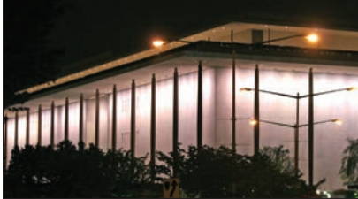
The Kennedy Center, sans Trump

Along those lines, we've been equally gratified that Trump has not only kept his distance from the sets of The View and The Late Show with Stephen Colbert but has irritated all the right people locally by refraining from attending such self-important Beltway rituals as the White House Correspondents' Association dinner and, last week, the Kennedy Center Honors.