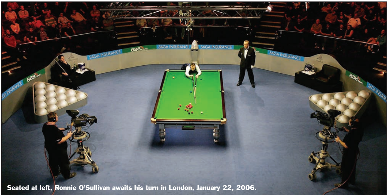
Seated at left, Ronnie O'Sullivan awaits his turn in London, January 22, 2006.

6 colors. Players continue a turn, called a break, until they miss, at which point their opponents get a chance. And all of this takes place on a table almost double the area of even the largest tournament-sized pool table, with pockets an inch tighter. Just to make things more difficult, the green baize covering a snooker table has a definite nap running in one direction, distinguishing the warp from the woof of the cloth. Many of the combinations allowed in pool are banned by the rules of snooker, which require the object ball, whether a red or the designated color, be the first ball struck by the cue ball. A foul results from accidentally potting a color other than the one the player named while lining up for the shot, which eliminates most bash-and-pray techniques.