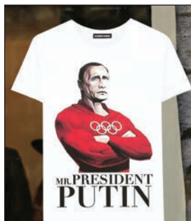
Ah, 2014—when corruption still worked

But setting aside the fact the Russians clearly deserve this punishment, we have to admit that the larger issue is one of don't hate the player, hate the game. What major sports body isn't full of cheaters and corruption? Two years ago, international soccer honcho Sepp Blatter and other FIFA authorities were brought up on racketeering, wire fraud, and money-laundering charges by U.S. authorities. Domestically, hardly a week goes by in which we're not talking about player conduct or corporate backstabbing in the NFL. In 2007, an NBA referee was caught in a gambling scandal. MLB has kept its