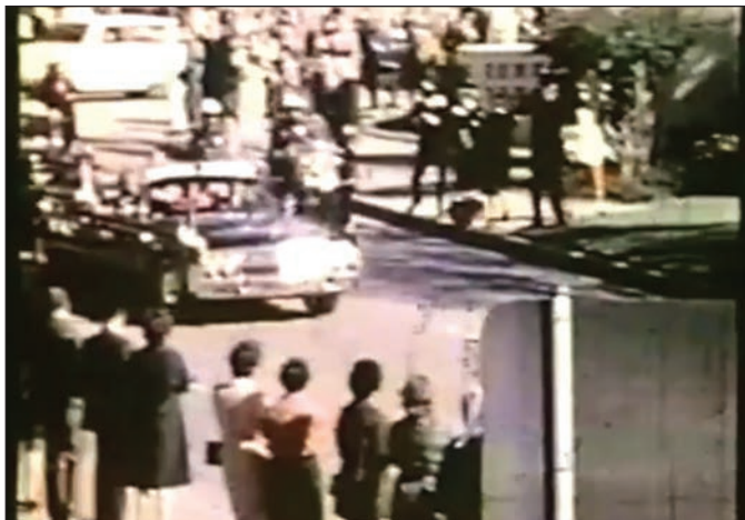
From film shot by Abraham Zapruder, November 22, 1963: Above, the presidential motorcade enters Dallas's Dealey Plaza; below, Kennedy reacts to being hit by the first bullet.

would not even let the ARRB's staff review records from the Manchester interviews she controlled, those of Robert F. Kennedy and Jacqueline Kennedy. The Manchester documents remain sealed for 100 years. Finally, lacking support from the White House and State Department, the ARRB fared no better in retrieving copies of the files from the KGB's aggressive and comprehensive surveillance of Oswald between 1959 and 1962.