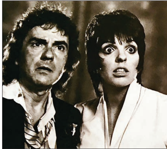
Play! Go on! We're watching!