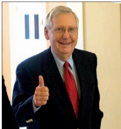
McConnell cracks a tax-reform smile.

The theoretical savings achieved by repealing the mandate allowed the Senate to create a bigger child tax credit and keep more tax breaks than the House bill did. The rules under which the tax bill was considered prohibit any increase to the deficit beyond 10 years, so repealing the mandate, which would save money for years to come, allowed Senate Republicans to make more of their cuts permanent.