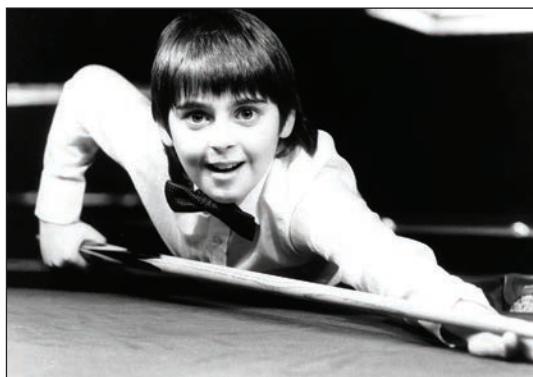
The Boy Wonder of Snooker in 1986

At most, then, a frame of snooker requires knocking in 36 balls: 15 reds, alternating with 15 colors, followed by the