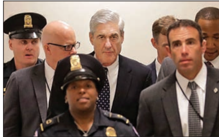
Robert Mueller on Capitol Hill, June 2017

But time presses, and the questions surrounding the investigation’s credibility are not trivial. Make haste, counselor, make haste. ♦