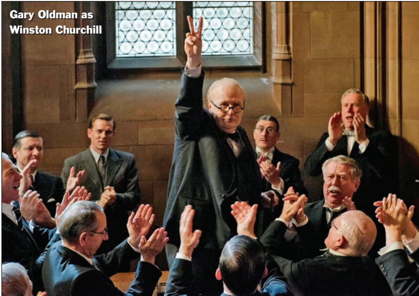
Gary Oldman as Winston Churchill