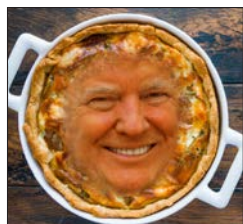
Don't spoil the meal.

These reflections occurred to us this week when we happened upon a feature story in the New York Times titled "Meatless and Motivated." The subhead: "Black Americans are going vegan in growing numbers, driven by issues of health, politics and more."