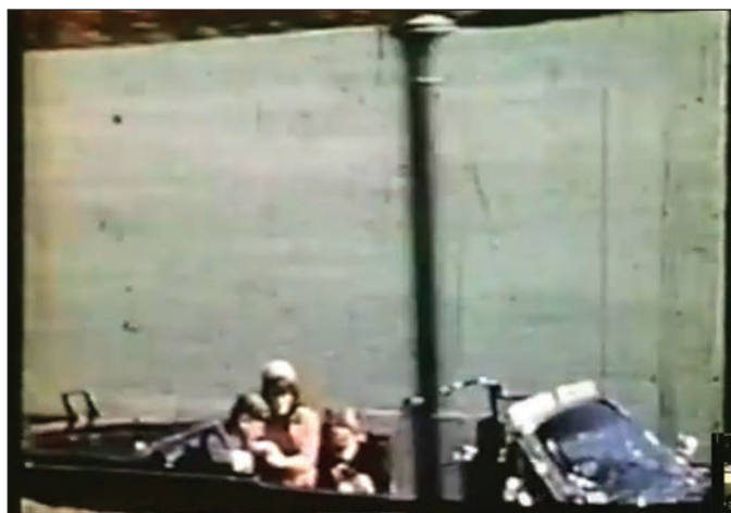
Above, Kennedy slumps toward his wife; below, the second bullet strikes.

All of these facts are readily learned from the ARRB’s final report—published in 1998 and available online—and