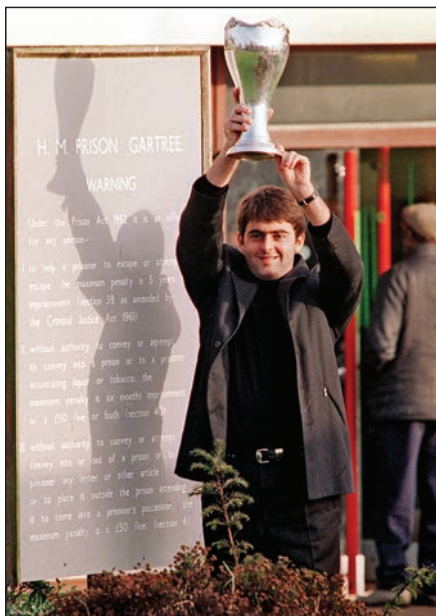
Ronnie O'Sullivan taking his U.K. championship trophy to show his father in prison, November 1993

The highs and lows of that 1997 tournament are a perfect microcosm, a lasting figure, for much of O'Sullivan's odd career. Every sport has seen players of undoubted ability (think of, say, football's Ryan Leaf) who failed to click at the professional game. Every sport, for that matter, has seen any number of players who had runs of brilliance (think baseball's Denny McLain) but never quite put together an extended career. What's rarer are the athletes who have shown what, for any others, would have been greatness at a high level for a considerable period but nonetheless appear to leave their talent unfulfilled. Mike Tyson, certainly. Mickey Mantle, perhaps. Jim Brown. The wildly emotional early years of John McEnroe. Tiger Woods, maybe. Often enough, father-figure demons haunted them. Many of them drank, drugged themselves, and misbehaved, rebelling against the activity that had made them famous. All of them found less joy in the sport than we believe we would have, when we imagine ourselves with their stratospheric levels of talent.