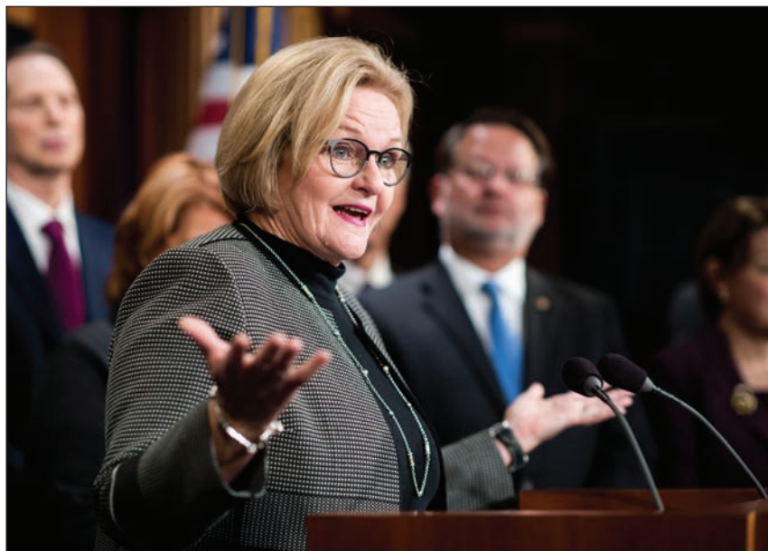
Claire McCaskill and other Democrats foretell a worker's apocalypse, November 28.

There are plenty of understandable objections to the tax bill sailing through Congress. Some people think it will increase the deficit. Others cry foul that it is being rushed through without sufficient deliberation. And there are those who like big government and frankly oppose the idea of letting people and, most especially, companies keep more of the money they earn.