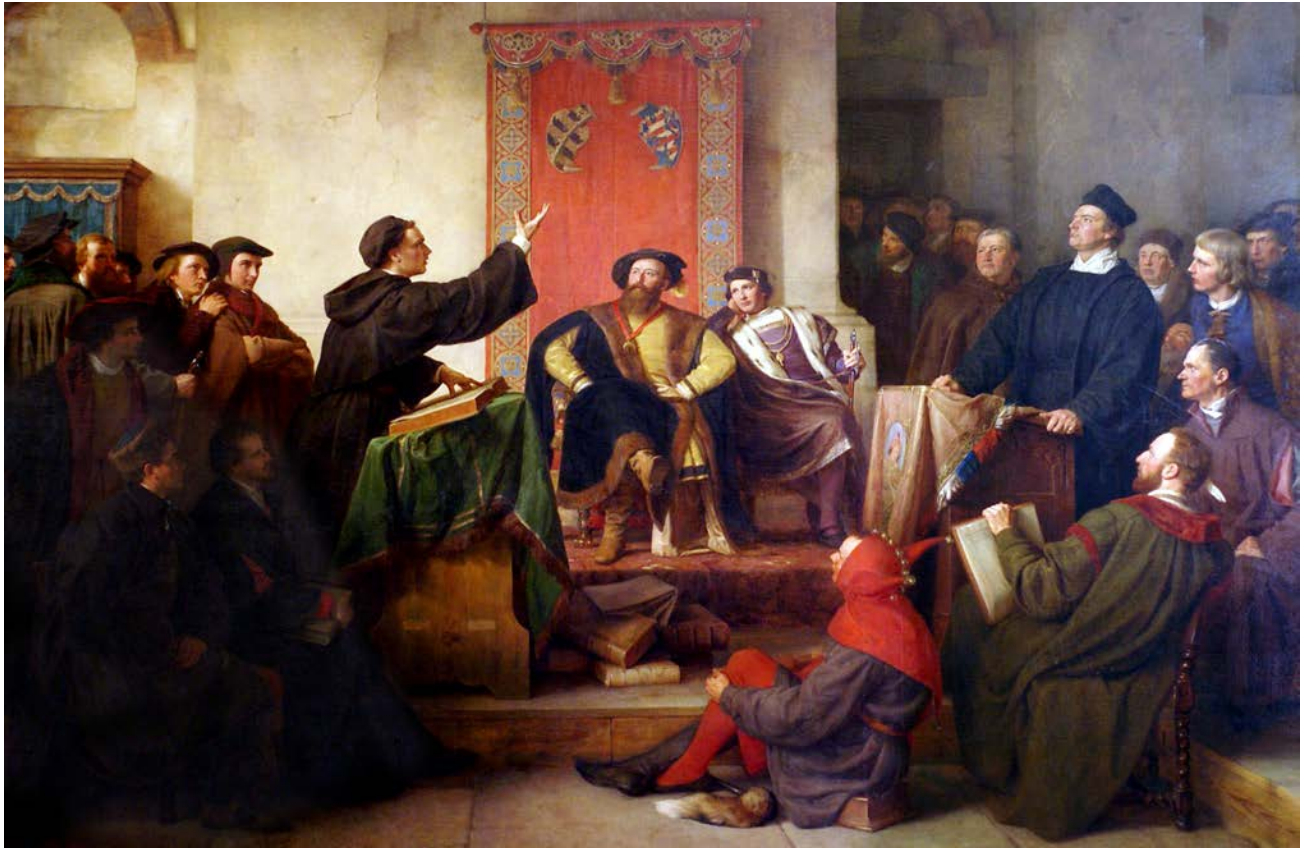
'Disputation Between Martin Luther and Johann Eck at the Pleissenburg in Leipzig' by Karl Friedrich Lessing (1867)