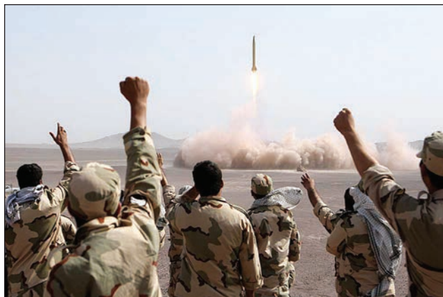
Members of Iran’s Revolutionary Guard Corps celebrate the launch of a long-range missile.

For the noninterventionists, there is always one overarching theme: America should no longer be a Middle Eastern power, and Americans don’t really care about the region’s conflicting ideologies so long as Americans aren’t being blown up. The obverse of Americans wanting to distance themselves from the Muslim world and reduce the flow of Muslims coming to the United States is a nonchalance about intra-Muslim politics—about who rules over whom. The post-9/11 understanding that America had paid dearly for its indifference to Muslim tyrannies has, because