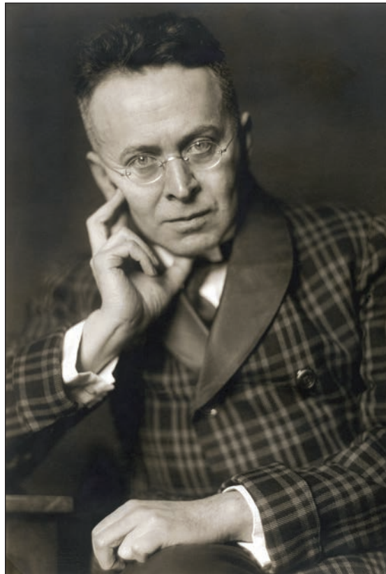
Karl Kraus (1928)

illustrated an apocalyptic Kraus essay with a lithograph of subhuman hordes poised to descend upon an overripe Europe. For Frank Wedekind, author of the scarifying Lulu plays, Kraus