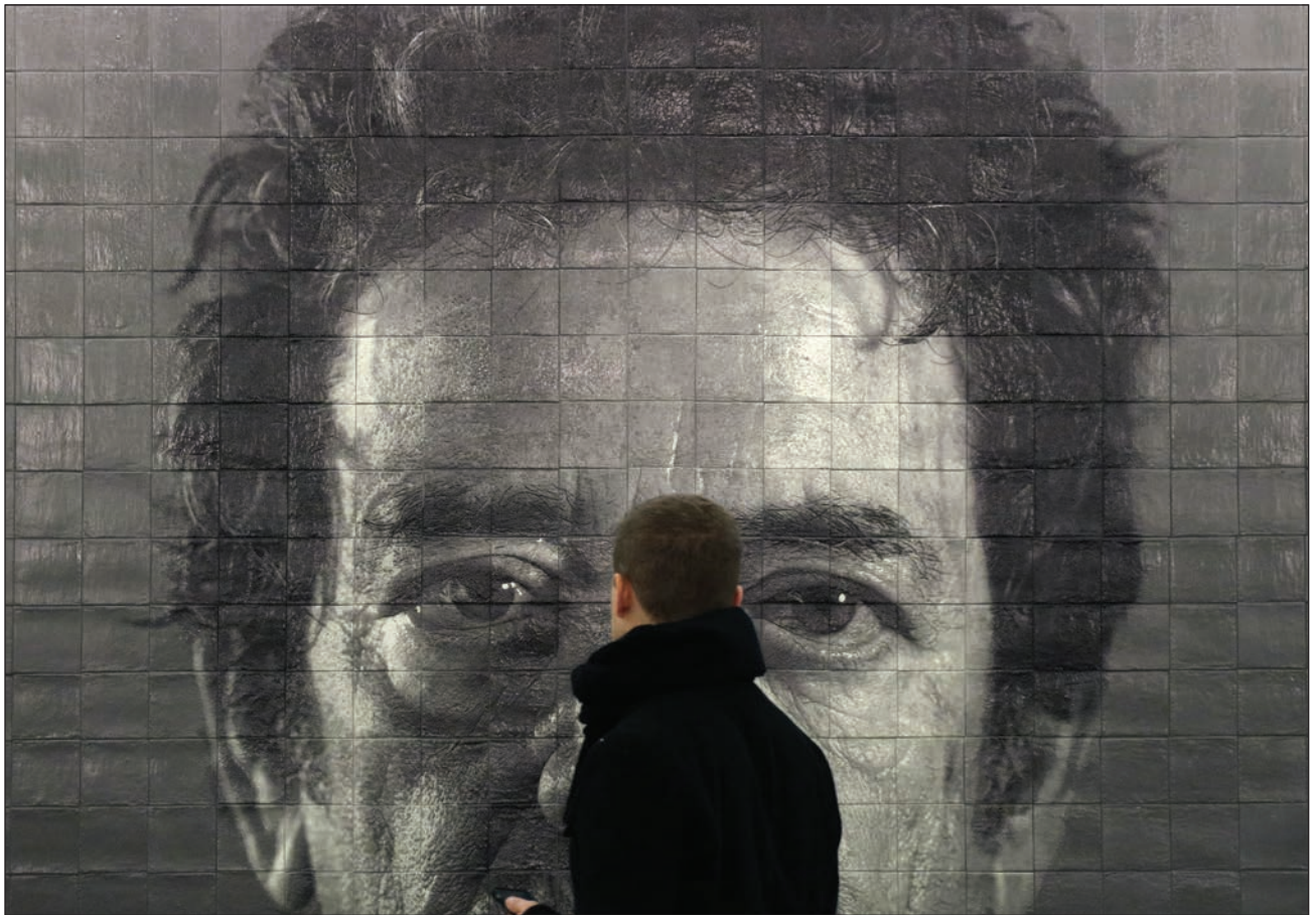
Portrait of Lou Reed by Chuck Close

which has been given over to the mosaicized photographic images of Muniz. As befits the egalitarian, one-city spirit of such projects, the full spectrum of contemporary urban existence has been delightfully depicted on the white porcelain walls of the station: A father and child with balloons, society women, a turbaned Sikh, a gay couple, and a middle-aged man running after papers that have flown out of his attaché case—they are all here. Beyond the work's choice and abundant detail, its chief artistic pleasure is that shock of recognition that we feel in seeing our neighbors transformed into mosaics as virtuosic as those of Venice or Ravenna.