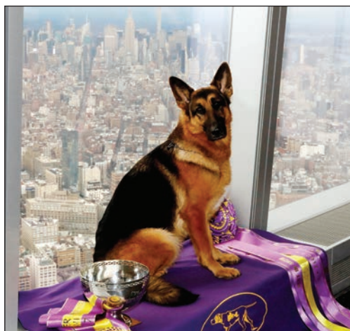
Rumor, winner of Best in Show at the Westminster Kennel Club in Manhattan, February 15, 2017

There came a time, though, when dogs infiltrated the