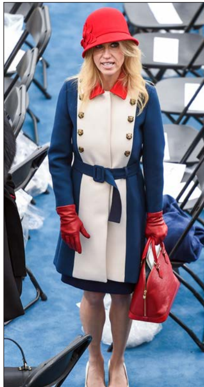
Who wouldn't believe this woman?

But if that’s what viewers took away, how is it that the Sunday shows failed? If the Trump “spokespeople”