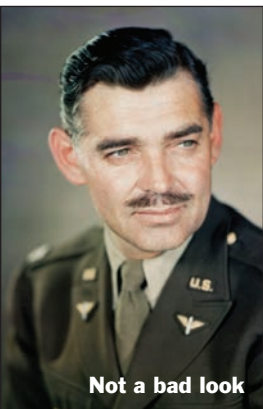
Not a bad look

Some other suggestions were eminently sensible: Soldiers told the Army Times they want to put rank back on