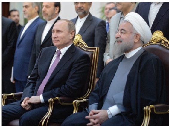
Firm partners: Russia's Vladimir Putin and Iran's Hassan Rouhani ink agreements in Tehran, November 2015.

last ballistic-missile launch added another 25 minor targets. Treasury and Congress could zap the regime's praetorians quickly with hundreds more, effectively preventing most A-list European or Asian companies from dealing directly with the corps or its proxies. The guards' access to hard currency outside of Iran would become difficult, as well as their sanctions-evading shell-game with false-flag and limited partnerships with foreign firms.