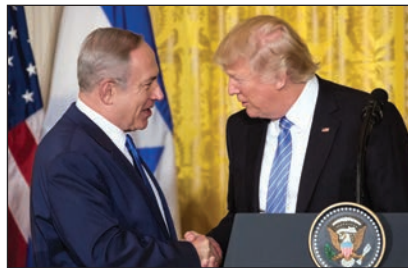
Trump and Netanyahu, February 15

The criticism of Trump for this “abandonment” is misplaced. At least since Bill Clinton, a “two-state solution” has been the insistent American goal, but where has it gotten us—or the Israelis and Palestinians? Trump is focusing instead on the goal, which is peace, and saying any road that gets us all there can work for him if it can work for the parties. Criticism of this position is foolish, elevating the means over the end. He has not abandoned the two-state solution; the hand-wringing