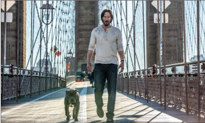
Keanu Reeves and friend at the Brooklyn Bridge

Every now and then a movie comes out of nowhere to surprise you. It's usually a small-scale piece of genre work whose own producers are likely so relieved just to have it done and get it released that they don't really know they might have something special on their hands. Last year's big surprise was Hell or High Water , a bank-robber film about which nobody knew anything until it suddenly appeared—and you knew from the first moment you saw a getaway car making its way through the back alleys of a dusty West Texas town that you were seeing something fresh and unexpected. It's a Best Picture nominee—the least likely Best Picture nominee in many years.