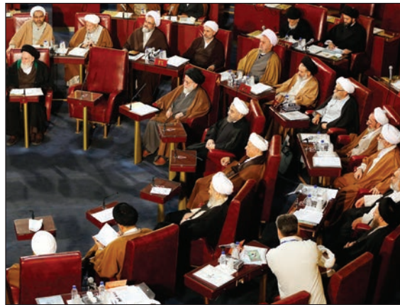
Iranian clerics during the annual meeting of the Assembly of Experts in Tehran

Although Salehi doesn’t dwell on the now-suspended visa ban against Iranians, the action surely surprised, probably shocked, him and his superiors. Iranians hate to be lumped with Arabs. Many in the regime loathe Iranians who flee to the West, especially the United States; but many of the most senior officials, even within the top echelons of the clerical elite, have family members in the United States. Children of VIPs frequently study in the West—the most prestigious locales are in America. The Islamic Republic has always had considerable cognitive dissonance about the United States, which is most personally played out with children of the elite, both dissident and regime-loyal, making pilgrimage to the mullahs’ bête noire .