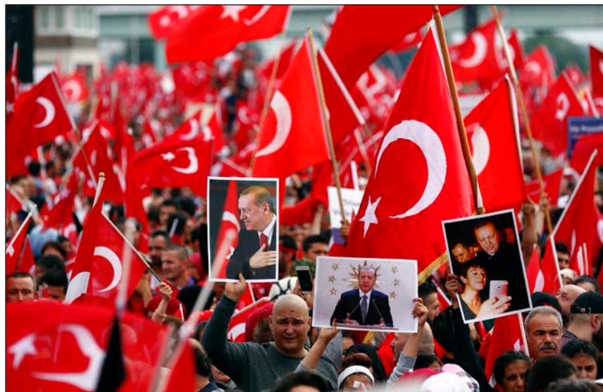
Protesters wave Turkish flags during a pro-Erdogan rally in Cologne, July 31, 2016.