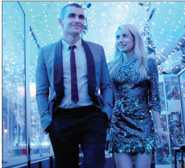
Dave Franco, Emma Roberts

they contribute goes into a giant pool. The Watchers think up dares for the Players they follow. The Players have to execute the dare in a matter of minutes. The Watchers observe the Players execute the dares in real time on their smartphones, which are broadcast by the Players through their smartphones. The more risky the dare, the more lucrative the dollar reward, which is instantly transferred to the Player's bank account. But it's not just about the money. The Players are also consumed with scoring as many followers as possible (in the manner of an Instagram account) so they will become famous inside the world of the game.