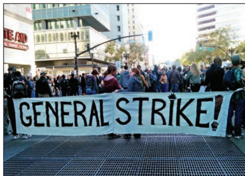
Good enough for Oakland (2011), good enough for us

parties seem to be offering options that spell disaster for the country." If anyone might be expected to fall into the #NeverHillary camp, you'd expect it to be Sowell. His catalogue of the likely exploits of a Hillary Clinton administration is sobering. But the economist just can't bring himself to make a positive case for Donald Trump and won-