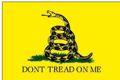
The Gadsden flag

The erosion of America's public square continues at an alarming rate. This week brings news that the Equal Employment Opportunity Commission (EEOC) is seriously entertaining a claim that a man wearing a hat with the image of a Gadsden flag on it—that's the famous coiled snake emblazoned with the words "Don't Tread On Me," flown during the American Revolution—constitutes workplace harassment. According to the EEOC decision on the matter: