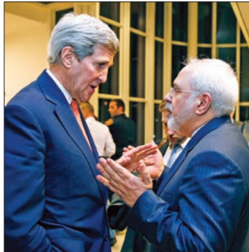
Secretary of State John Kerry haggles with Iran’s Mohammad Javad Zarif.

The Obama administration has never shown much interest in compelling the Iranians to abandon their habit of taking hostages. Quite the opposite, in fact. The administration built its Middle East policy around the idea that it