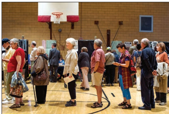
Well, look who's actually at the polls.

Although many political pundits and the national media repeatedly stress the important role millennials and Hispanics will play in the