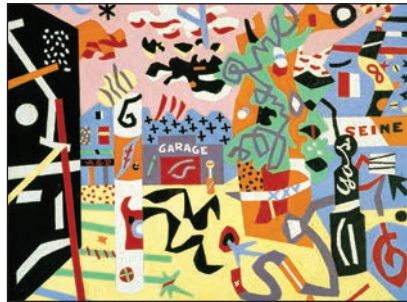
'Report from Rockport' (1940)

Stuart Davis In Full Swing Whitney Museum of American Art through September 25