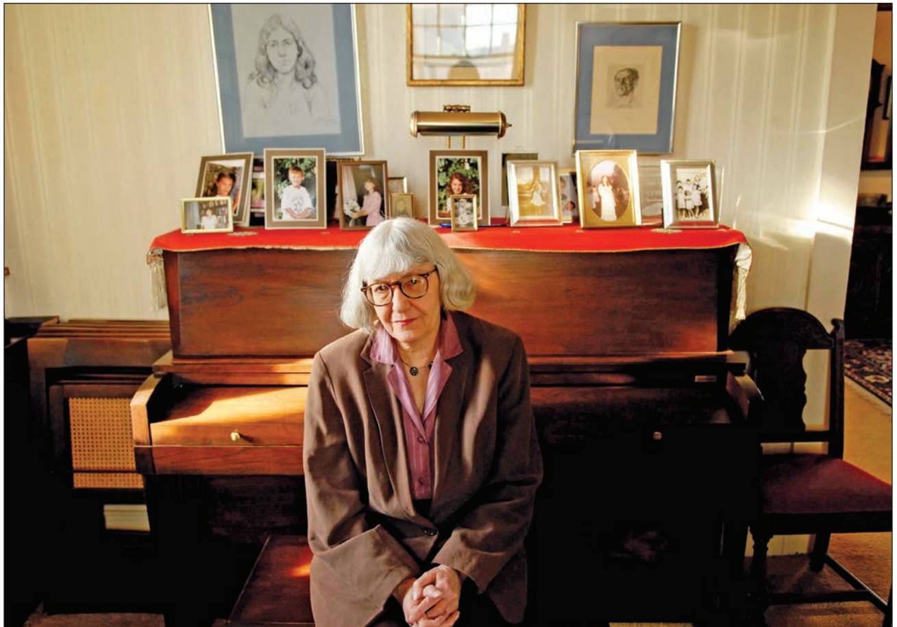
Cynthia Ozick (2007)