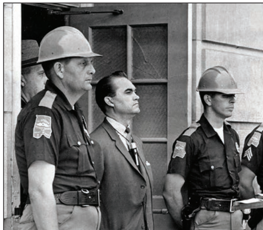
Wallace blocks the entrance to the University of Alabama—and the enrollment of two black students—June 11, 1963.

made with voters, one might start with the fact that he was, literally (in the pre-Biden meaning of the word), a fighter. He boxed in the Golden Gloves and went to the state finals when he was 15, losing by a decision in a tough fight in which he broke his thumb. The injury was severe enough to require surgery, but he kept fighting and playing football. In 1937, he was the Alabama Golden Gloves champion in the 120-pound division. So he not only liked fighting; he was good at it. And he kept at it through college and into the