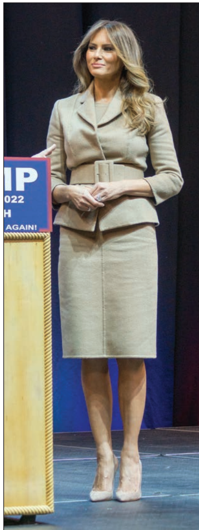
No beauty does she lack.