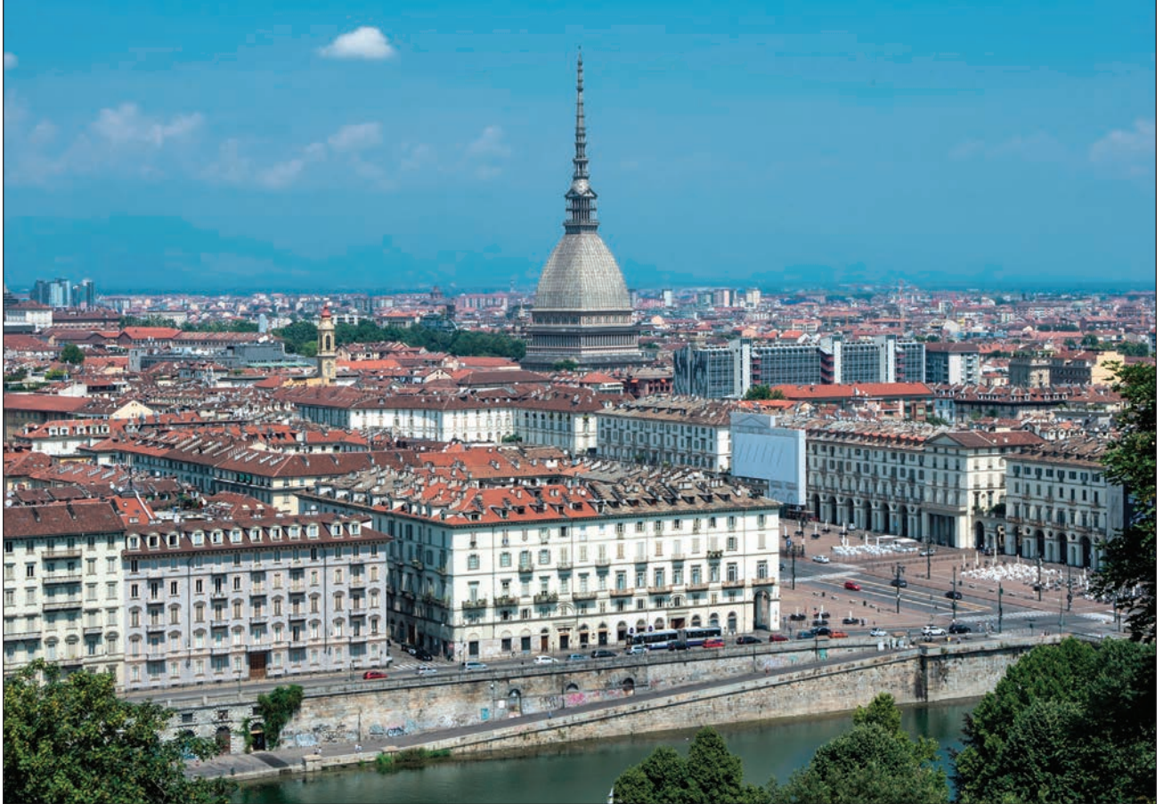
Mole Antonelliana in the Turin cityscape

of New York's snail-shell Guggenheim Museum. Visitors will remember the famous scene in the Michael Caine movie The Italian Job (1969) where minis are chased around the rooftop racetrack after performing a daring heist.