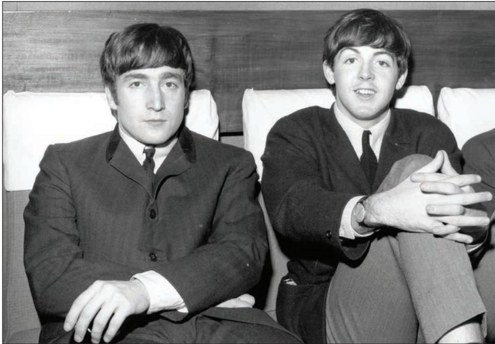
John Lennon, Paul McCartney (1963)