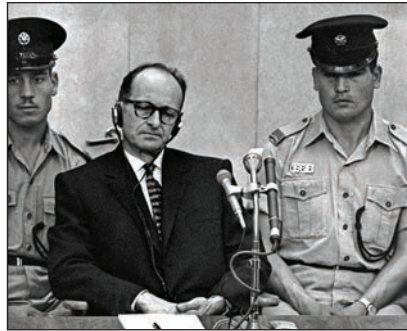
Adolf Eichmann on trial (1962)