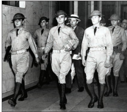
Long surrounded by members of the National Guard, circa 1934

Who took on the Standard Oil men And whipped their ass Just like he promised he'd do? Ain't no Standard Oil men gonna run this state Gonna be run by little folks like me and you Here's the Kingfish, the Kingfish Friend of the working man The Kingfish, the Kingfish The Kingfish gonna save this land.