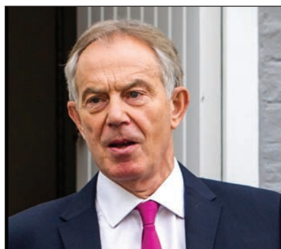
Tony Blair in London, July 7, 2016

American juggernaut. It's entirely possible that if George W. Bush had been a better diplomat, if Secretary of State Colin Powell had not so often sent mixed messages about whether the United States could be dissuaded from conflict, if he'd just bothered to travel to Europe to chat with natives, the die might have been cast differently. Blair would not have been "America's poodle" if France had joined the coalition: The effect of French participation, even if led by a conservative French president, on the antiwar Western left would have been significant.