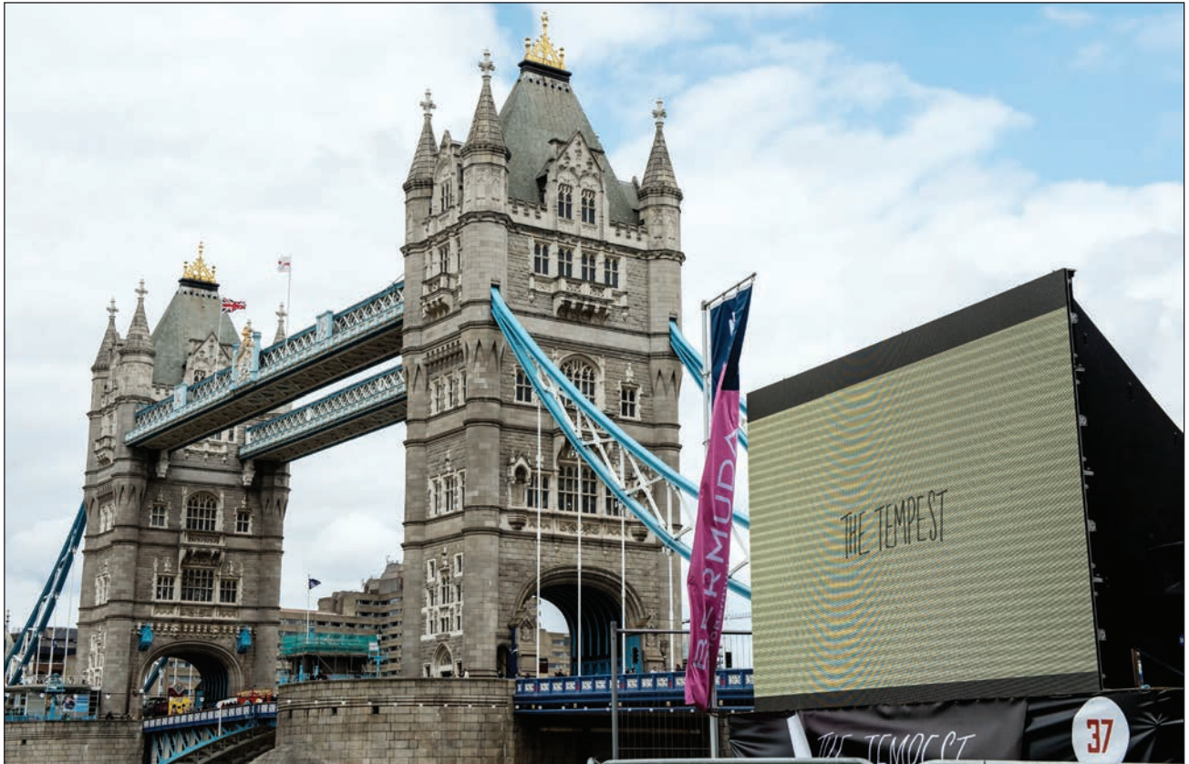
'The Tempest' on the South Bank

Meanwhile, the age of organic food and period orchestras has produced Shakespeare's Globe Theatre, a modern replica built on the site of the original and dedicated to authentic performances of the plays.