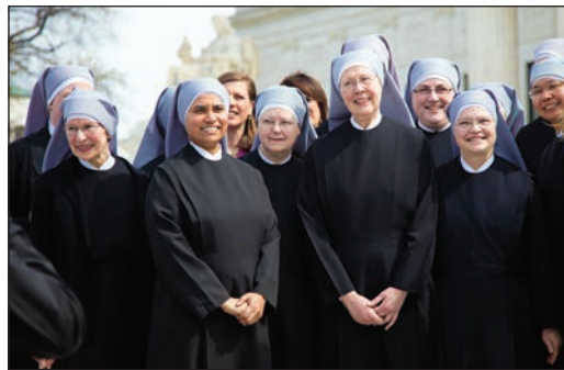
Little Sisters: unlikely targets

In similar spirit, after two terms of President Obama and team, a standard