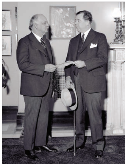
Long, right, presents his Senate credentials to Vice President Charles Curtis, 1932.

Long also, no doubt, saw the Farmer-Labor candidacy as a losing proposition and sensed that it was not yet his