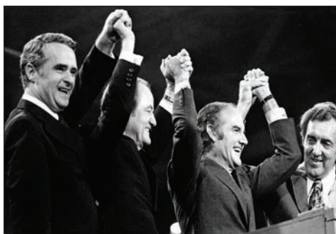
From left, Eagleton, Humphrey, McGovern, and Muskie share the finale of the Democratic National Convention, July 13, 1972.

living full-time in Wisconsin and organizing the state so intensely that by March of the next year, each of the state’s 72 counties had a volunteer nucleus, paid organizers were staffing numerous storefronts, while “ten thousand unpaid volunteer workers were walking blocks and country roads, marking voters on precinct sheets . . . indicating the degree of pressure to be exerted to bring them out on primary day.” In California, the campaign’s operation was state of the art, “the most efficient technical apparatus ever fielded by any candidate in a primary,” with 283 storefront offices, 500 organizers from out of the state, precise polling that charted the movement of sentiment, and a system in which print-outs of names, on which volunteers coded questions and answers, were shipped to centers where computers “spat out and mailed a personalized form letter from George McGovern to each numbered respondent, addressed to that voter’s central concern.” By contrast, the campaign of Humphrey, the last establishment figure left standing, looked back to a long-ago era in which candidates relied upon unions, leaders of ethnic blocs, and machines in big cities to turn out their clients. It was at this point, just before California, with McGovern leading in most polls by double digits, that the institutional Democrats awoke to the fact that the party of