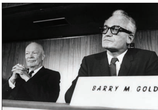
Eisenhower and Goldwater at a GOP 'unity' meeting, August 1, 1964

At least the Republican establishment had recognized Goldwater as a threat to their interests as early as 1962, even if they weren't able to do much to stop him when the time came to act. By contrast, it took Democrats until May 1972 to recognize the campaign waged by George S. McGovern—who was as far to the left as Goldwater had been to the right of the country,