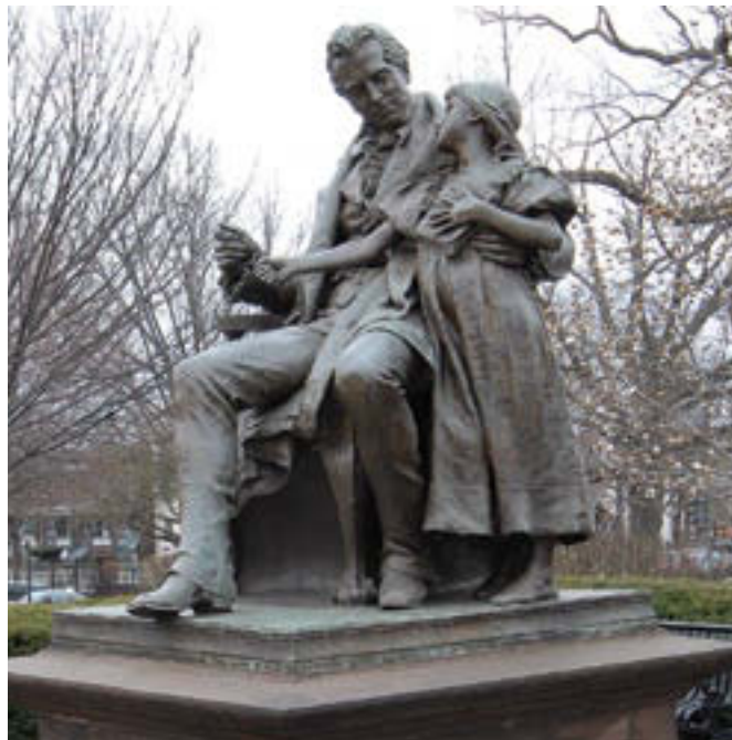
Statue of Thomas Gallaudet and Alice Cogswell

newspaper op-ed comparing ASL to Ebonics). Strolling through Gallaudet’s pristine and architecturally charming campus, all signs of the recent sixties-retro strife erased by a vigilant landscaping staff, one hopes that he is wrong. One campus landmark is a striking bronze fin-de-siècle sculpture of Thomas Gallaudet and Alice Cogswell, the 9-year-old deaf daughter of a neighbor to whom Gallaudet painstakingly taught sign language in 1814—in a form of which today’s deaf activists would disapprove. This politically incorrect hearing man of nearly two centuries ago and the adoring little deaf girl so equally politically incorrect—what an apt symbol of all that the university founded in Thomas Gallaudet’s name has turned against. ♦