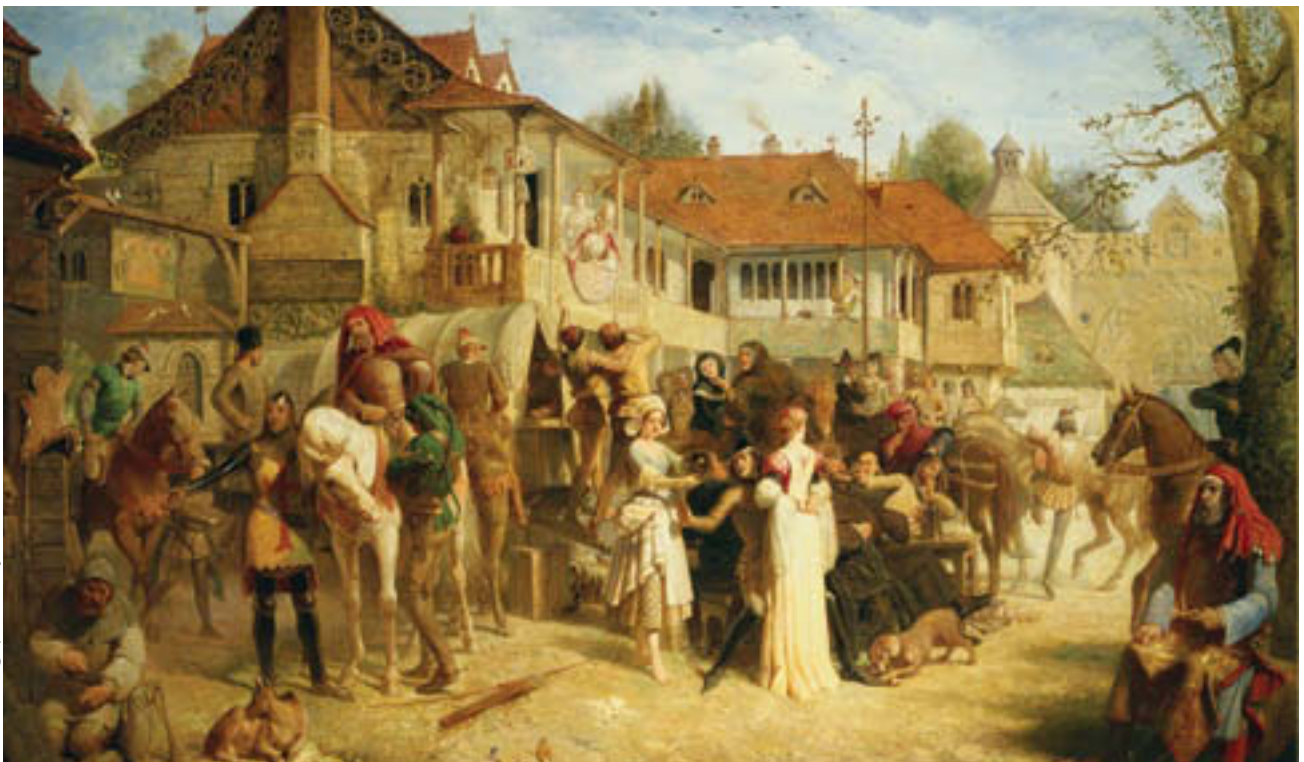
'Chaucer's Canterbury Pilgrims at the Tabard Inn' (1897) by Edward Corbould