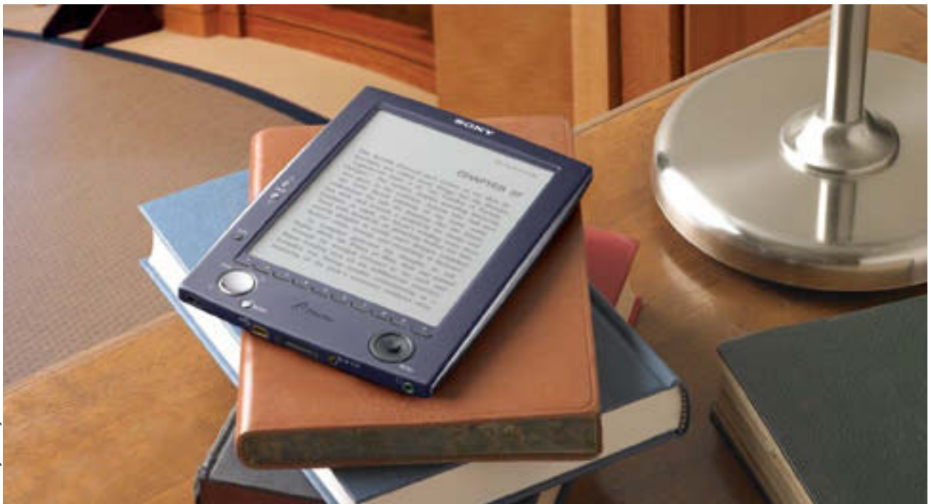
'More reading . . . fewer books'

potential to reduce the clutter of books. For me, the perfect advertisement for this device would be a picture of my bedstand without its ever-present leaning tower of literature. More reading, the tagline would say, fewer books.