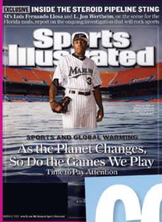
SPORTS AND GLOBAL WARMING As the Planet Changes, So Do the Games We Play; Time to Pay Attention —Sports Illustrated cover, March 12, 2007