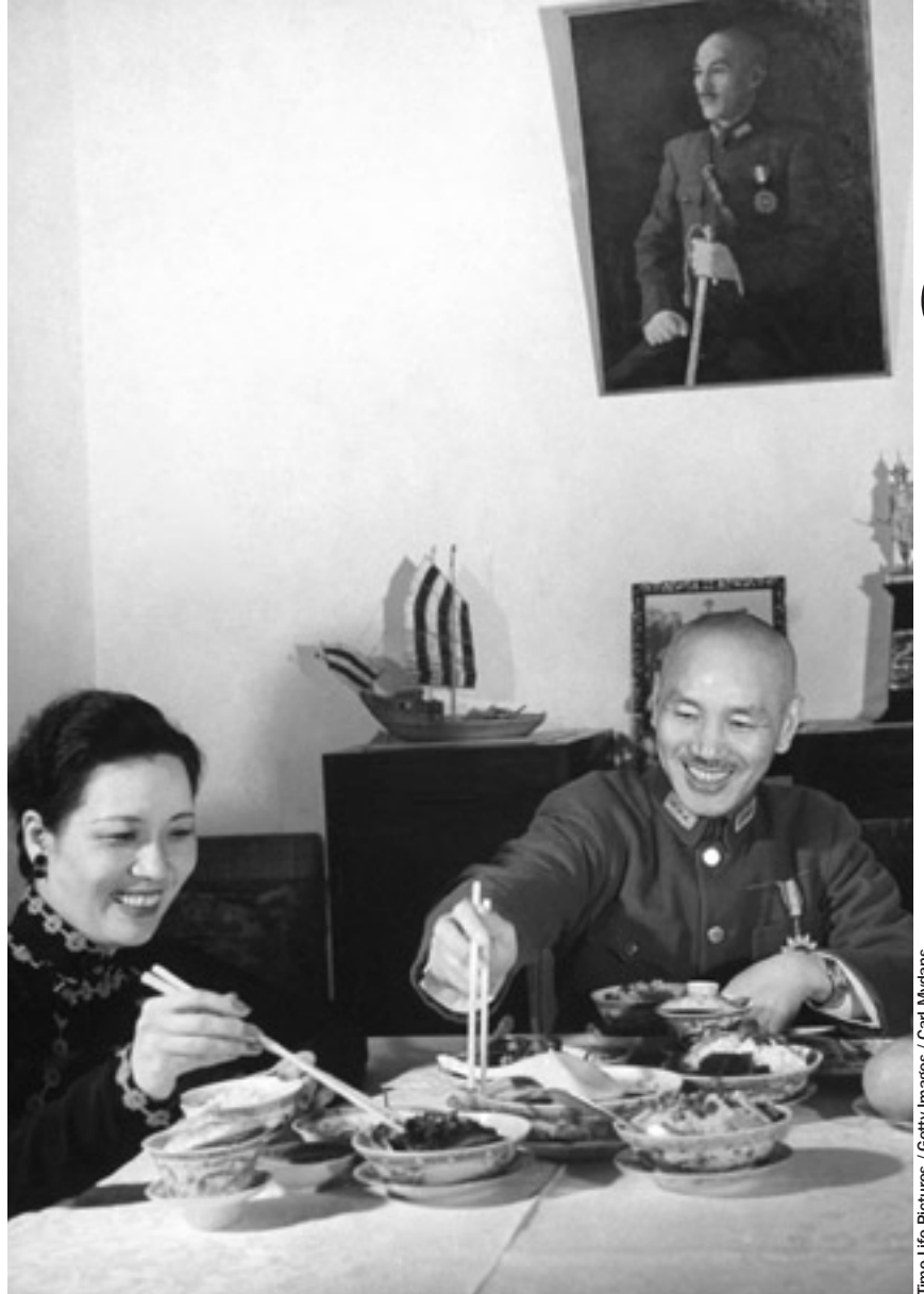
The Generalissimo and the Missus, 1941