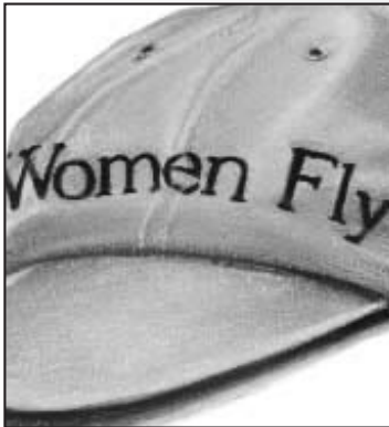
Cover art by Kevin Chadwick

19 THE DEATH OF GIRLHOOD The meaning of an airplane crash—and the slogan on a cap. by WENDY SHALIT